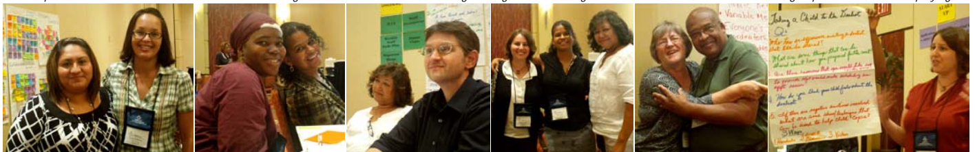
Participants from HIPPY USA's 2010 Preservice Training are shown below. The week-long training, held each August in Little Rock, AR, included lectures, group activities, and role playing.

Preservice is a required training for all new coordinators and assistant coordinators. We also encourage program supervisors from HIPPY implementing agencies to attend for the first two days. Attendance by administrators provides a unique opportunity to obtain relevant information regarding the HIPPY program model, its philosophical underpinnings and specific administrative requirements.