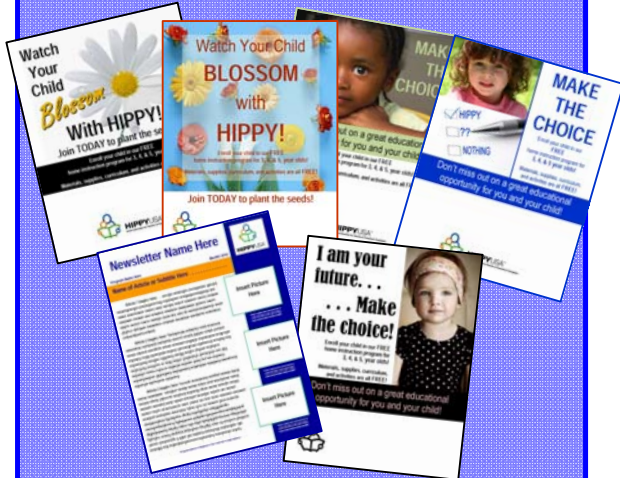
Shown above are images of the new sample recruitment flyers and newsletters available in the library section of the HIPPY USA web site.

For questions or more information about the HIPPY USA web site, log in information, or to submit photos, ideas, or suggestions, please contact the national office at 501.537.7726 or email info@hippyusa.org .