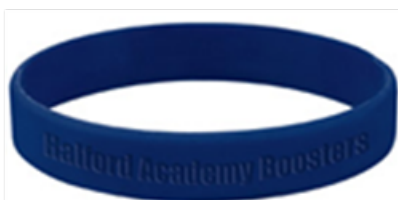
Child and adult wristlet