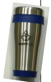
Travel Mugs $8