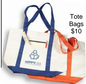
Tote Bags $10